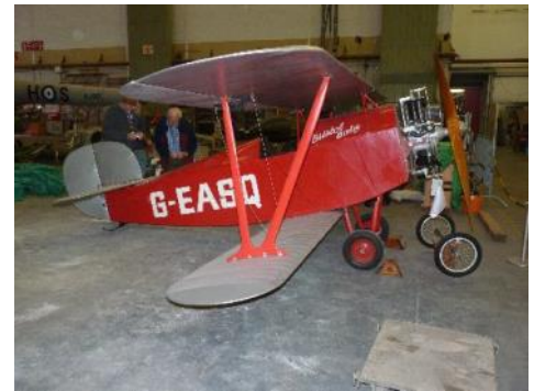
The answer! Bristol Babe