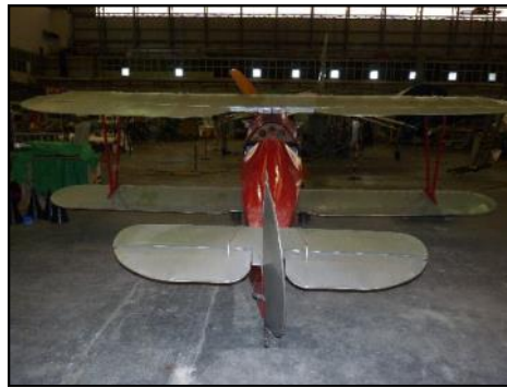
Last month's picture