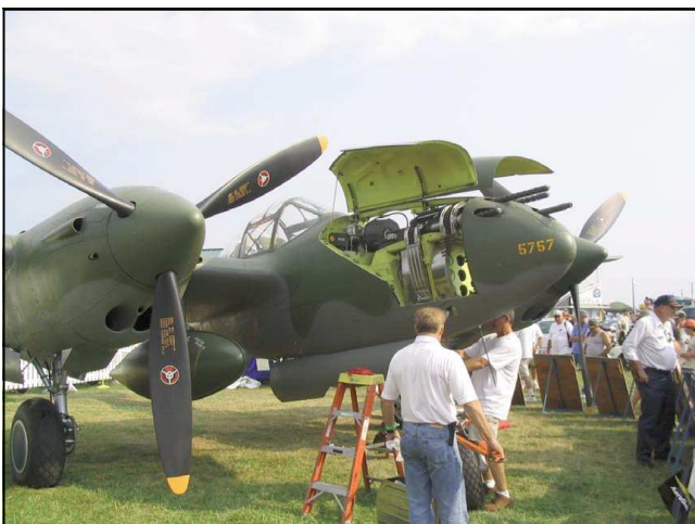
Glacier Girl – P38 Lightning