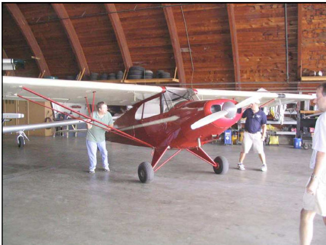
Preparing the Piper PA12 Supercruiser