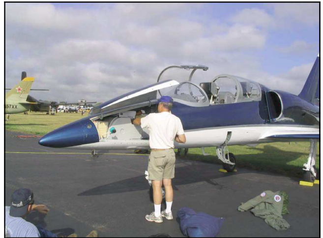
'Hollywood' packs his L39 to go home

Unfortunately they had dispersed and loaded onto a fleet of jeeps before I got within normal camera range. It seemed that everywhere one turned, something amazing was happening! I made my way, by the shuttle bus, back to the main show ground. As I arrived, the loudspeakers announced the imminent arrival of a pair of F22 Raptors, this was going to be the highlight of the show, as many of the key design features are still considered secret. Spectators were informed that frontal photographs were OK but no pictures were to be taken of the rear (variable angle nozzles). Of course there is always one who either does not hear the broadcast or just ignores it, one lady was corralled by security almost as soon as she lifted the camera to her eye. No doubt any pictures she took were erased or if it was a conventional camera, the film would have been confiscated.