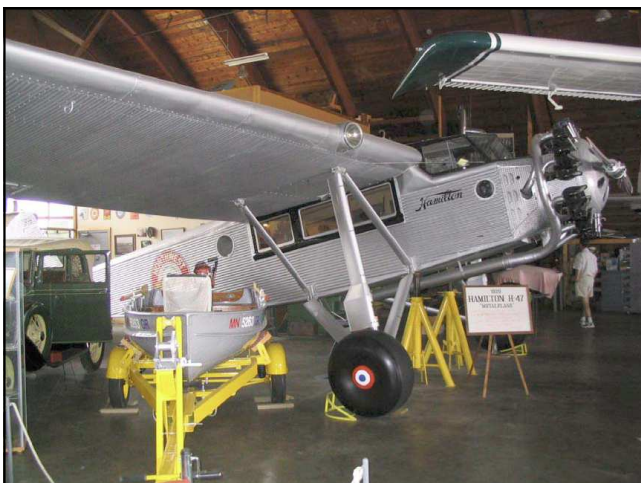
Hamilton H-47 Metalplane