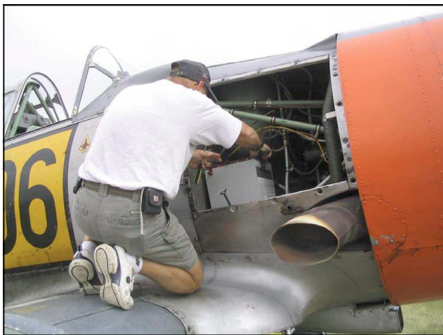
Changing the battery

One element of the display was a parachute drop. This consisted of several parachutists descending with flags suspended from their ankle. The difference with this drop was that there were a couple of T6 Texans (Harvards to you and I) circling the parachutes and trailing smoke during their descent, which made the whole thing even more spectacular. The last parachutist had a HUGE Stars and Stripes suspended and in a well rehearsed manner, spectators were asked to 'remove your covers' while the National Anthem was sung over the PA system. The amazing bit was that just as the anthem came to a close, the parachutist's foot touched terra firma! Incredible timing and worthy of the roar of applause which followed.