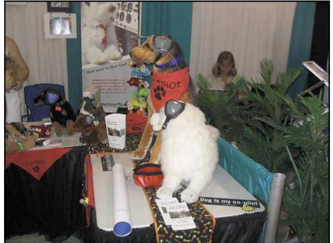
Doggy ear defenders

One segment of the airshow is devoted to a recreation of the Reno Air races, with high performance warbirds racing between imaginary pylons at either end of the runway. A superb display of pushing thoroughbred aircraft to the limit of their performance but without the aggression of a real race. The sound of high performance aero engines still raises the hairs on the back of my neck! On completion of this segment of the show, on what I believe was the Thursday, tragedy struck when two Mustangs collided during landing, killing one pilot and seriously injuring the other. I didn't see the accident, I didn't need to, to feel what everyone else felt – a sense of sadness and loss for both man and machine.