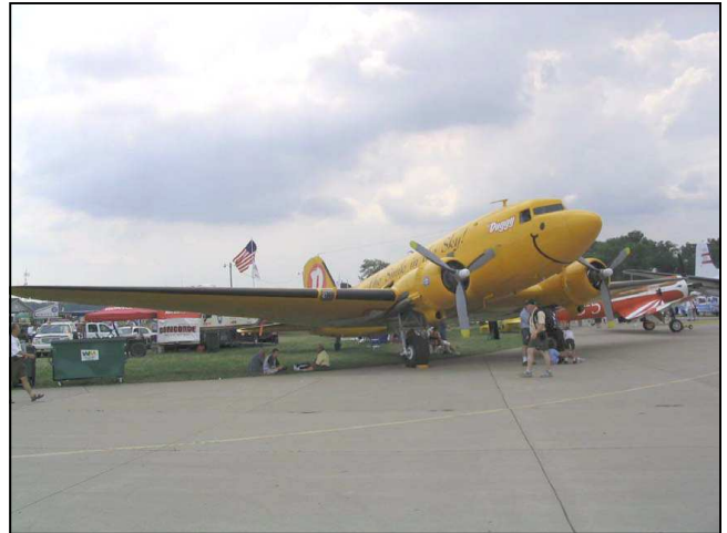
The happiest Dakota in the world !

I had been longing to go for twenty years or more, but work, home and family had always taken priority. What changed this dream into reality began with a chance encounter with a South African guy, who was visiting the UK on business. He arrived at our farm strip one Sunday morning just as the Microlight flying group were preparing for a day fly out. He is a flyer in South Africa and flies GA aircraft as well as weight shift and three axis Microlights. As our departure was imminent, I asked him if he wanted to come along, to which he eagerly accepted. I asked him if he wanted to do some of the flying but strangely, he wanted to navigate, oh well, why not, it takes some of the load off. A good flying day was had by all and afterwards he thanked me profusely and offered some cash for fuel, I couldn't accept as I was going anyway and besides, I had enjoyed his company.