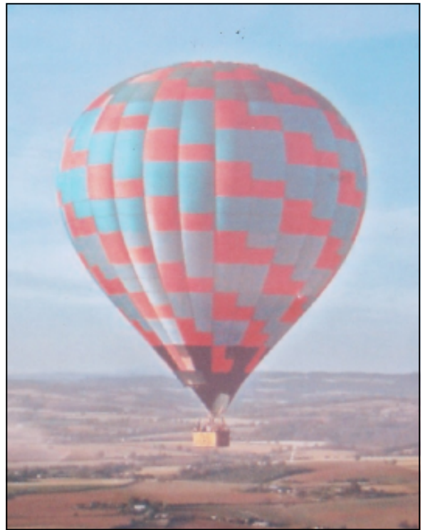
Lindstrand LBL 240

Late September, I had a superb flight in a Lindstrand LBL 240 hot air balloon from the grounds of the Chase Hotel at Ross on Wye. Famed pilot, Ian Ashpole, flew us, with 10 aboard, on a clear calm day, soon having distant views of Gloucester, Cheltenham, the Malvern Hills and distant Sugar Loaf. Ian rotated the balloon through 360 degrees and we climbed to a mile high, heading towards Newent and we had a smooth landing at Oxenhall after a brilliant 62 minute flight.