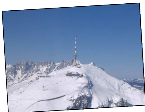
<-- Left Top station on the Horn with Wilder Kaiser range behind