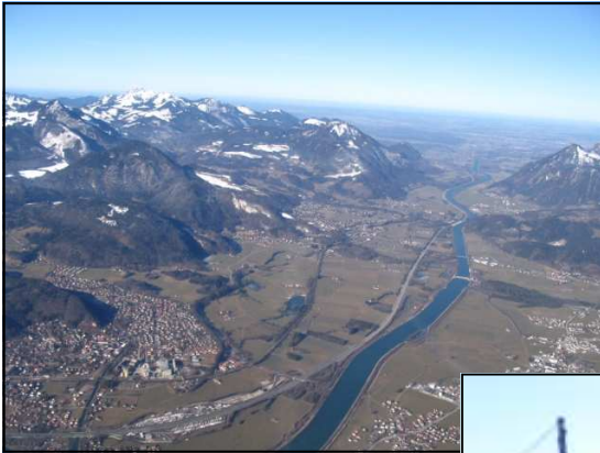
The Inn valley