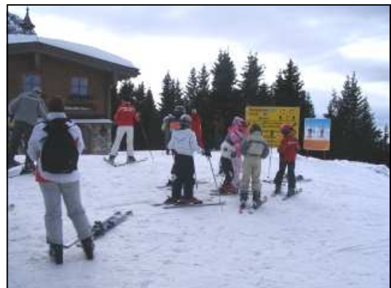
Skiers preparing to take to the piste