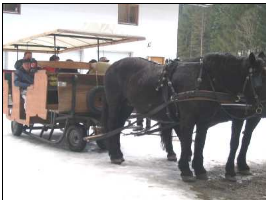
Anyone for a sleigh ride?