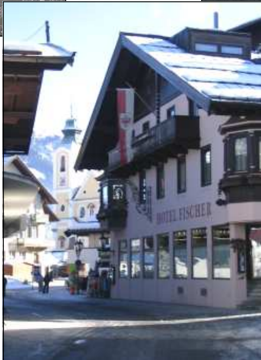
Top: the Hotel Fischer