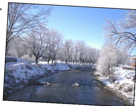
Right --> The Kitzbüheler Ache runs through St Johann