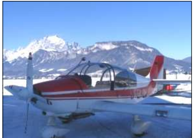
Robin DR 480 D-EKQM

The little town of St Johann-in-Tirol is the centre of the Ferienregion holiday area, nestling in the valley between the Kitzbüheler Horn and the majestic Wilder Kaiser mountain range. It also has an airfield just a stone's throw away! In the summertime the flying club at the sportflugplatz is busy launching gliders all day long, towed by a couple of Robin tugs, but in the winter-time most traffic consists of visitors flying in with their skis, on the way to the pistes.