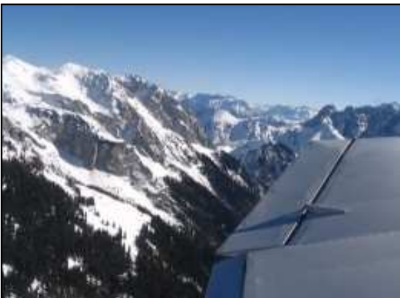
Christmas trees and mountains