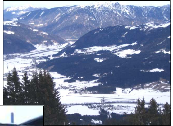
The airfield seen from the mountain